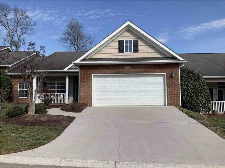
Subject Front 3727 Warmstone Way