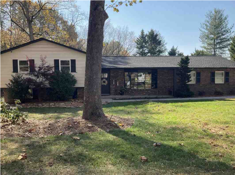
Subject Front 1517 Aldenwood Ln