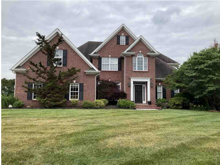
Subject Front 1523 Bickerstaff Blvd