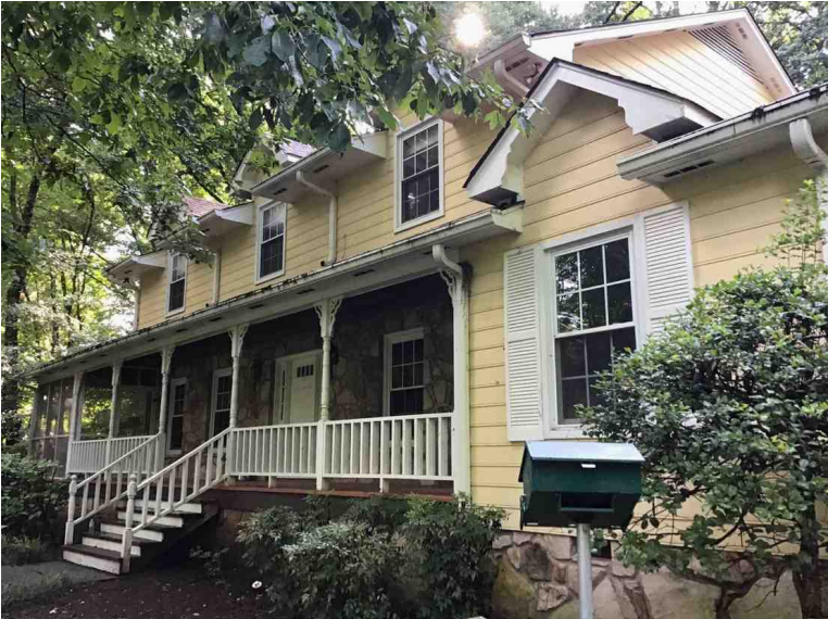
Subject Front 10820 Carmichael