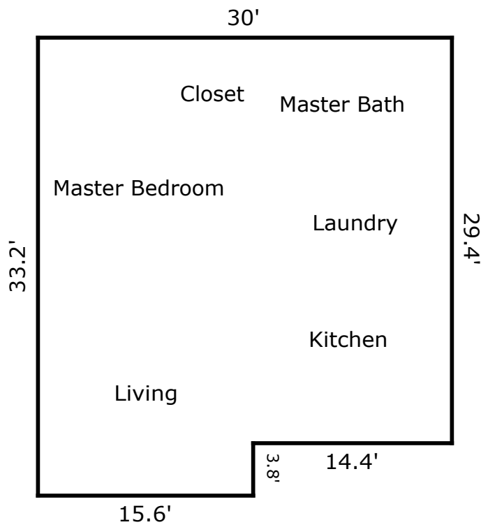
First Floor [941.28 Sq ft]