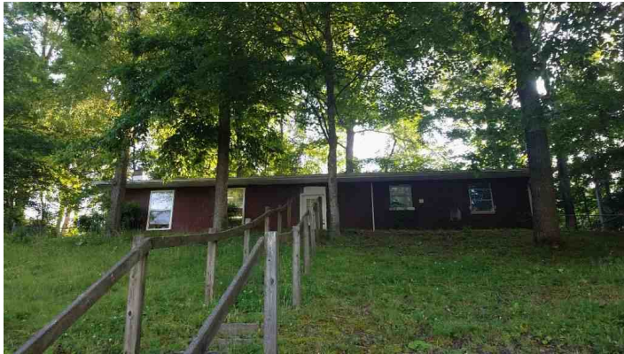
502b Miller Rd Front