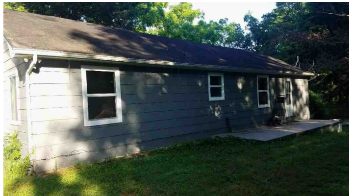
502 Miller Rd Rear