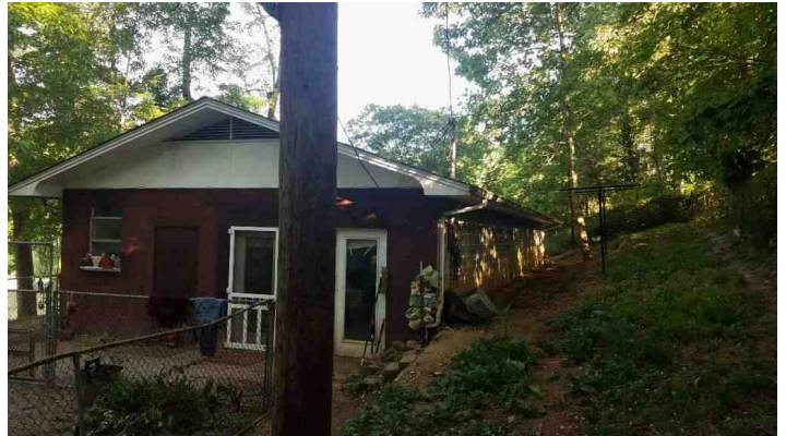
502b Miller Rd Side/Rear