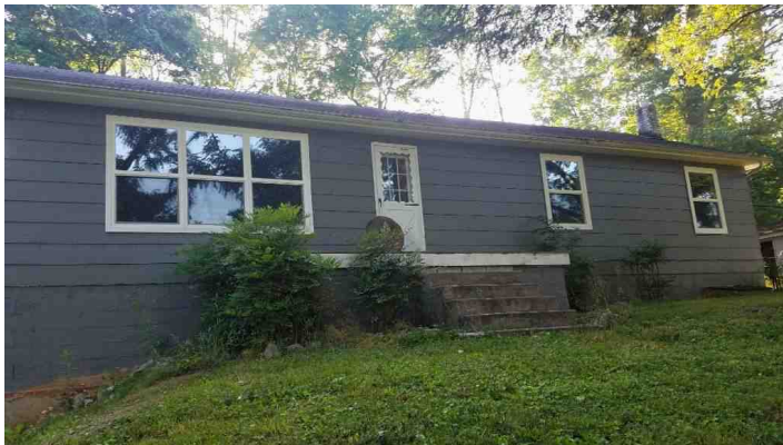
502 Miller Rd Front